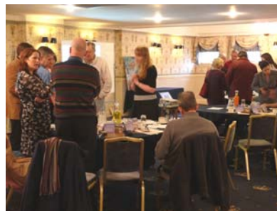
Yore Vision members and the public discussing progress on projects at the recent partnership 'Away Day'

Now nearing the end of our second year as an entity, this newsletter is the first of what I hope will be many that aim to bring members, partners stakeholders and the public up to speed on all that is happening with Yore Vision's plans and initiatives for improving the quality of life for all residents.